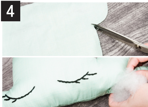
4- Crunch the corners and decrease the seam value in the rounding. Pull your cushion inside out and stuff it with plush stuffing.