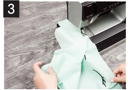
3- Assemble the front and back of your cushion and leave an opening of about 5 cm (2 in).