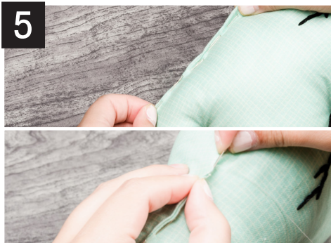
5- Close your cushion by making an invisible stitch by hand.