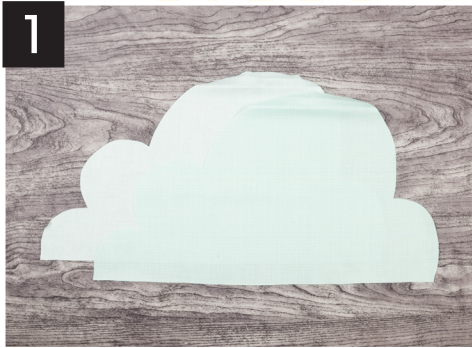
1- Cut the 2 pattern pieces into the fabric of your choice.