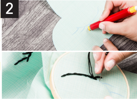
2- On the front of your cushion, draw with a pencil, the eyes. Then embroider it with an embroidery cotton thread in the colour of your choice.