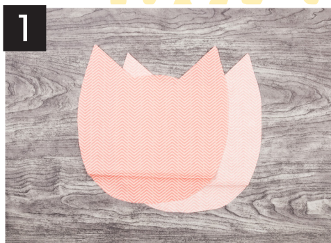
1- Cut the 2 pattern pieces into the fabric of your choice.