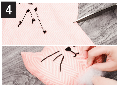
4- Crunch the corners and decrease the seam value in the rounding. Pull your cushion inside out and stuff it with plush stuffing.