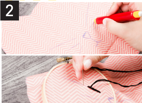
2- On the front of your cushion, draw with a pencil, the mustache, muzzle and mouth of your cat. Then embroider it with an embroidery cotton thread in the colour of your choice.