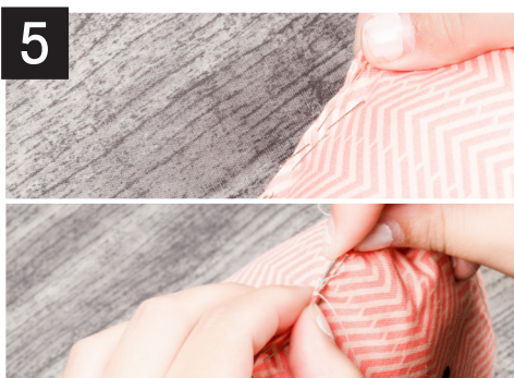
5- Close your cushion by making an invisible stitch by hand.